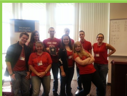
RESA 4 Regional Science Bowl Champions Oak Hill High School

Six teams of high school students competed at the 20 th annual RESA 4 Regional Science Bowl on Thursday, November 7, 2013 at the Summersville Arena and Conference Center. Students from Greenbrier East, Midland Trail, Oak Hill, Richwood, Valley and Webster County High Schools were on hand trying to earn one of the top three spots from RESA 4 to move on to the West Virginia Regional Science Bowl to be held Saturday, February 1, 2014 in Morgantown. That event will be co-sponsored by the US Department of Energy's National Energy Technology Laboratory and West Virginia University.