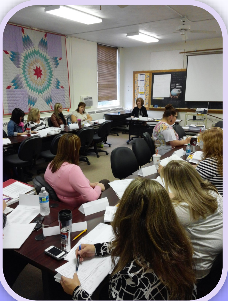
Pre-K ECERS Training on 9/23/13 at RESA 4