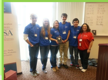
The team from Midland Trail High School finished in Third Place in the Bowl