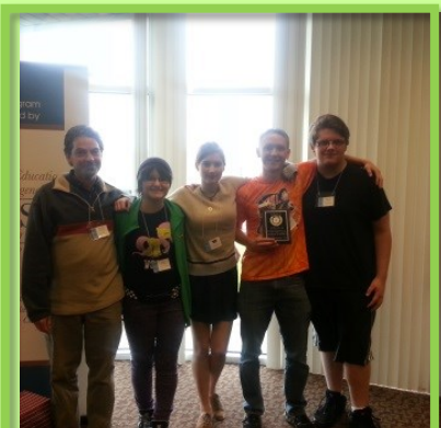
The Science Bowl Runner-Up Team from Greenbrier East High School

Six teams of high school students competed at the 20 th annual RESA 4 Regional Science Bowl on Thursday, November 7, 2013 at the Summersville Arena and Conference Center. Students from Greenbrier East, Midland Trail, Oak Hill, Richwood, Valley and Webster County High Schools were on hand trying to earn one of the top three spots from RESA 4 to move on to the West Virginia Regional Science Bowl to be held Saturday, February 1, 2014 in Morgantown. That event will be co-sponsored by the US Department of Energy's National Energy Technology Laboratory and West Virginia University.