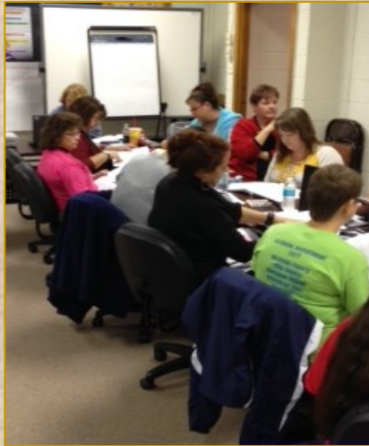
Some of the 23 participants at the final academy October 19, 2013.